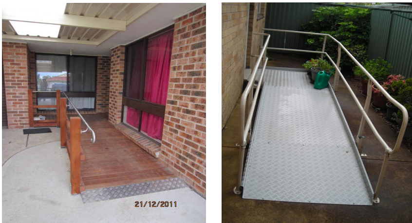
Figure 2 Permanent timber ramp and demountable ramp in similar locations

This research has identified widespread aesthetic issues around demountable ramps. Their appearance was one of the most commonly cited downsides of demountable ramps. In general, all ramps have raised aesthetic concerns because they occupy considerable space and are thus visible. Unattractive ramps have been discussed as a factor, which discourages home owners from accepting a ramp installation. Thus, ramps have been recommended to be constructed in a compatible style to the home so that they do not have negative impact on the appearance of a home (Duncan, 2004). Figure 2 illustrates the aesthetic difference that can be achieved between a permanent ramp in timber that is designed to match the home's design, and a demountable ramp for general use.