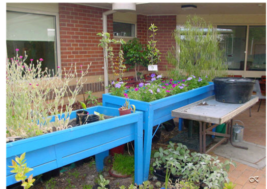
Figure 2: Royal Talbot Rehabilitation Centre, table planters.

The Association can be contacted via their website for advice on gardening projects.