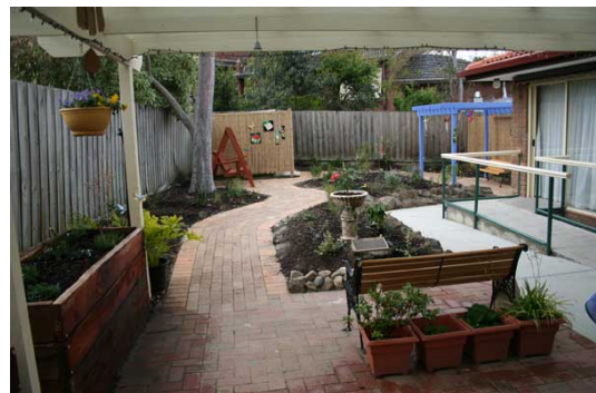
Figure 1: Yarraleen CRU Sensory and Edible Garden, from the Horticultural Association of Victoria (2006).

The photographs below are examples of a sensory and edible garden and an accessible garden.